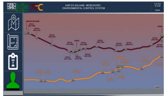
ECS User Interface