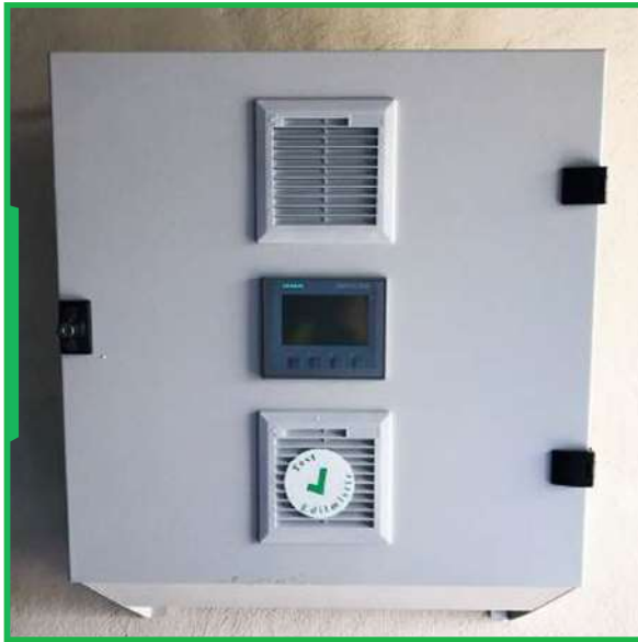
Alarm Control Unit (ACU)

Main functions of the Alarm Control Unit systems are detection, evaluation and monitoring of critical situations such as fire, intrusion, temperature and power supply (generator, UPS and distribution boards) status in technical buildings with related alarm notifications.